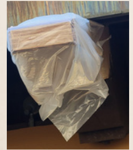
New Beam waiting to be painted