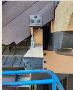
Old Beam Out