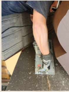
Remove the Old Beam