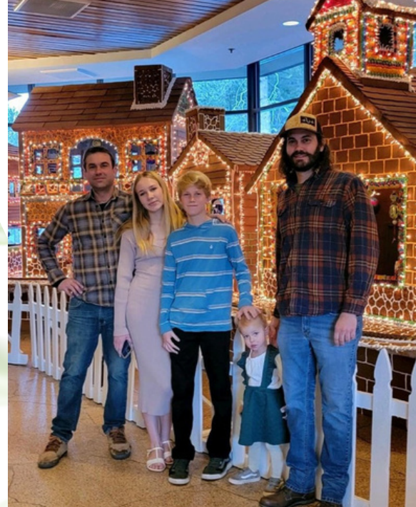
Arrow, FDL Goose Security