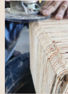
Shaping the New Beam