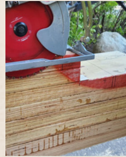
Constructing the New Beam