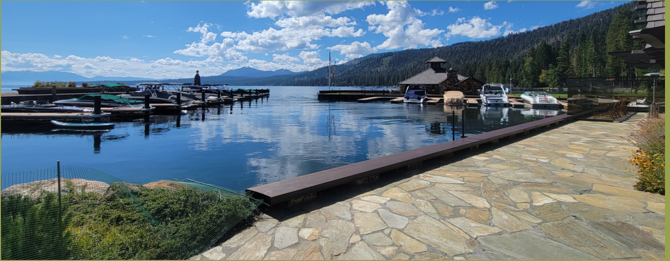
Beam repair begins at the Guard House July 2023

FDL Harbor Opens: The long awaited Dredging Project 2023 was completed at Fleur du Lac to restore our gorgeous harbor to its previous grandeur. The 70 year record-breaking snowpack in Spring 2023 also filled the lake significantly this summer, much to the delight of all Tahoe boaters.