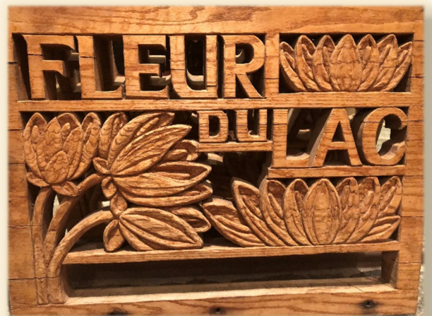
Original carved Fleur du Lac Sign