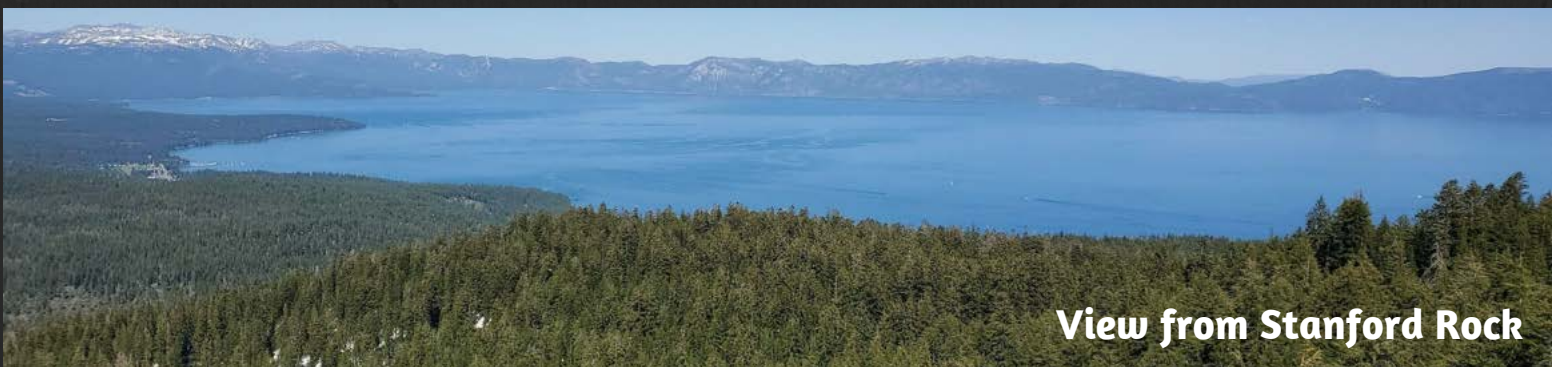
View from Stanford Rock

https://www.hikingproject.com/trail/7036551/stanford-rock-trail