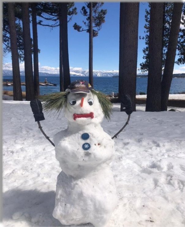
SNOWMAN BROUGHT TO YOU BY BOLDT GRANDCHILDREN

emerge and the property is trying to catch up from its long winter nap. At long last... Spring has sprung and a fun-filled Summer is just around the corner! The lake is topped off, and the rivers are raging. It's going to be a great Summer on the water!