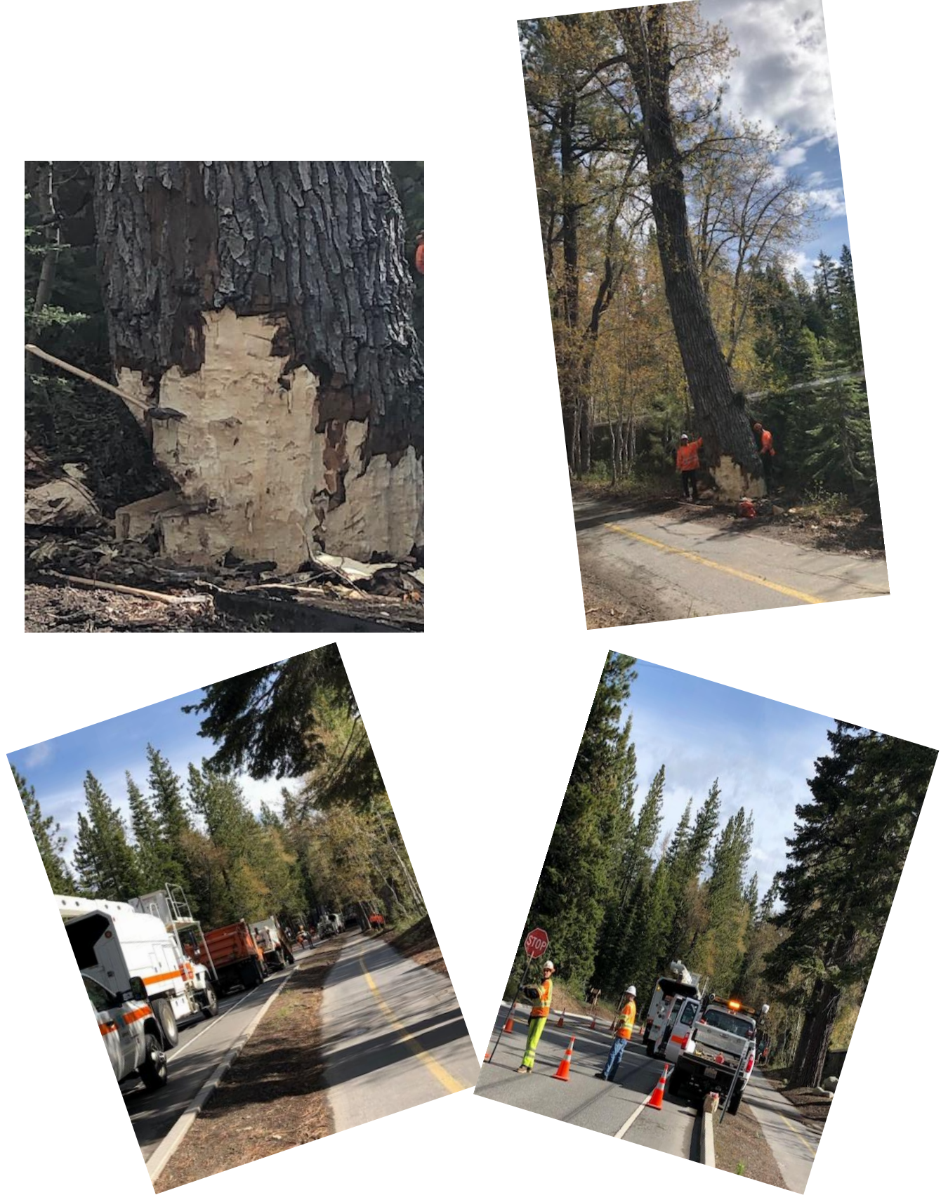
Cal Trans took out four large cottonwoods on Highway 89 which – as you can tell from all of the equipment and personnel involved – saved FDL lots of money!